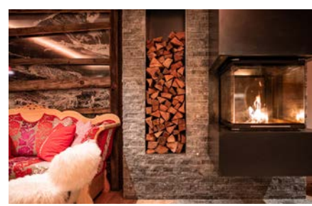
Romantik Hotel Julen