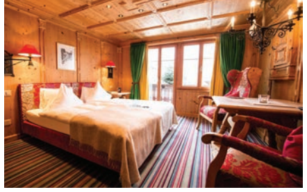
Romantik Hotel Julen Guestroom