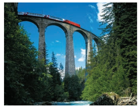
By Rail to the Valais Holiday