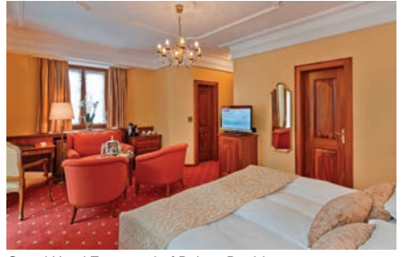
Grand Hotel Zermatterhof Deluxe Double Room