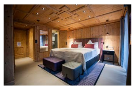
Romantik Hotel Julen

from Hotel Julen, for example, is the perfect place to spend the evenings, with live music, international guests, and a lively atmosphere. The Romantik Hotel Julen offers an authentic and memorable taste of traditional Swiss lifestyle, with many quirky characteristics and a very welcoming vibe.