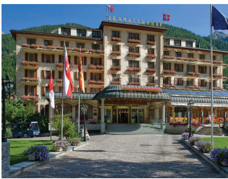
Grand Hotel Zermatterhot

at the end of a day exploring Zermatt. The Alpine Spa is perfect for whiling away a few hours one afternoon or morning; equipped with swimming pool and waterfalls, soothing treatment rooms, a cosy lounge, an intriguing ice grotto, and a range of saunas that promote different aspects of wellbeing. Guests are sure to finish their stay here feeling rejuvenated and revived. The Grand Hotel Zermatterhof is recommended for those looking for a relaxing, indulgent few nights at the foot of some of Switzerland's most popular mountains.