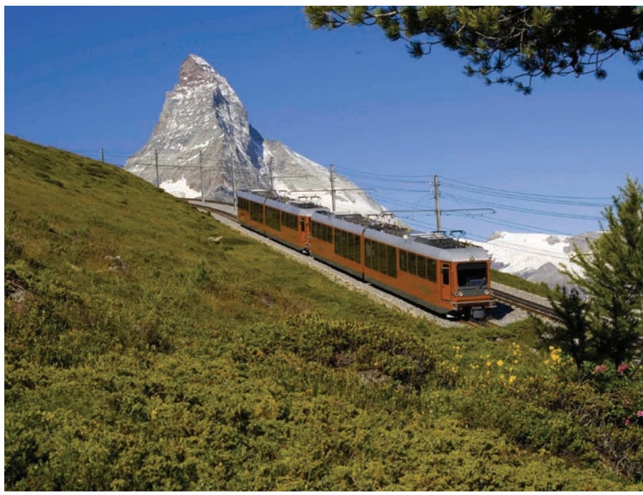
Gornergratbahn above Zermati