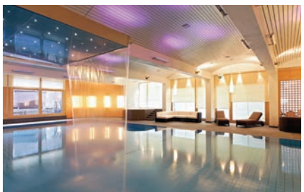
Grand Hotel Zermatterhof pool